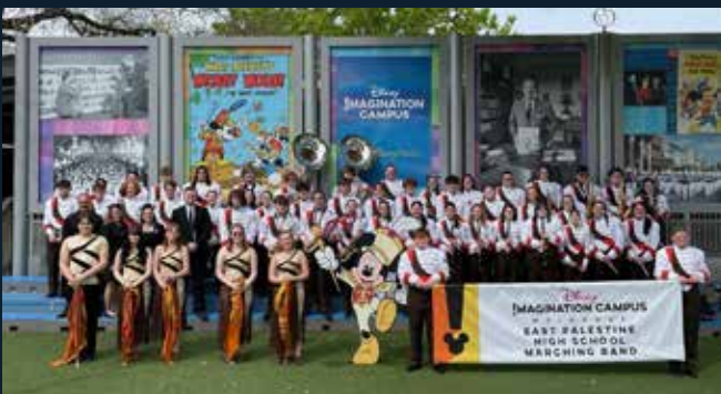
Pictured is the Bulldog Band.