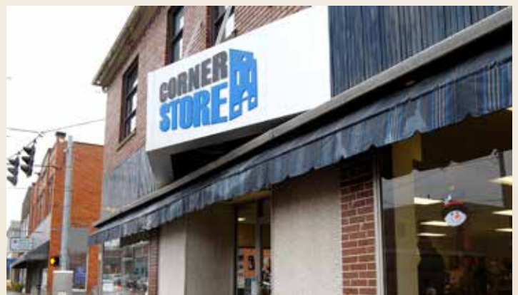
Celebrating its 13th anniversary, the Corner Store embodies Threshold's commitment to community integration by providing meaningful employment to individuals with Developmental Disabilities.