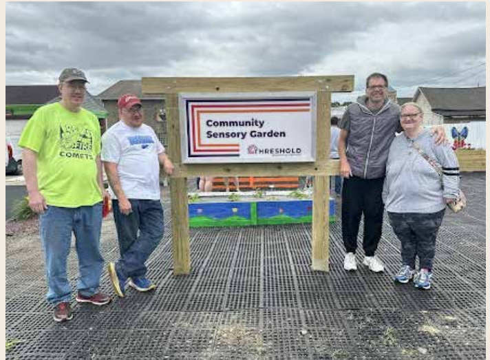
The Community Sensory Garden maintained by Threshold Residential supports the East Palestine community and residents with developmental disabilities, allowing for a safe, relaxing, and educational space.